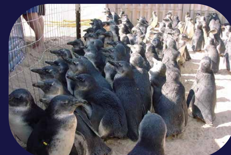
One group of rescued juvenile African penguins at our South beach rescue site.

This intensive project lasted 3 months. Once birds were ready to fend for themselves, waterproofed, at goal weight and condition, and deemed fit by vets, they were flown back to Cape Town to be released onto Robben Island .